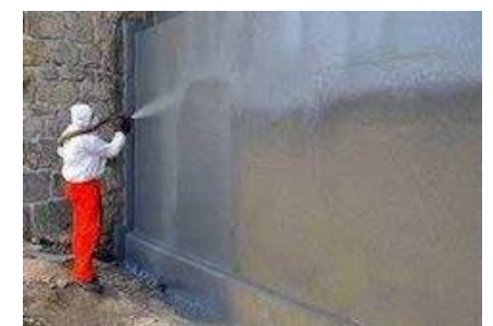
ANTI CARBONATION COATING