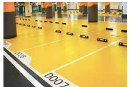
CAR DECK FLOORING