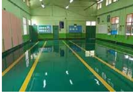
CHEMICAL RESISTANT FLOORING