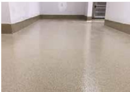
EPOXY QUARTZ FLOORING