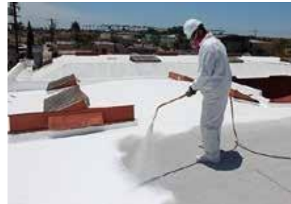
HEAT INSULATION COATING