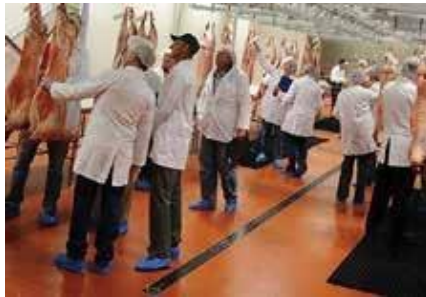
PU CONCRETE FLOORING