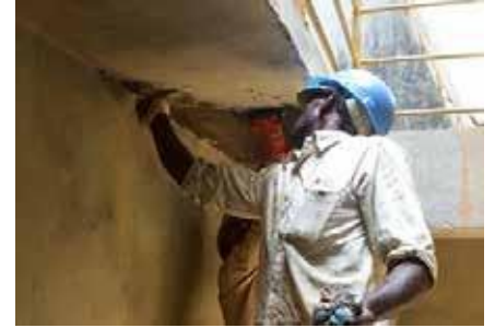
CHEMICAL RESISTANT EPOXY LINING