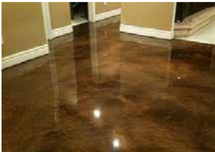
METALLIC EPOXY FLOORING