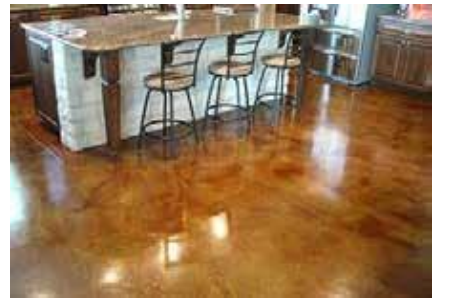
STAIN CONCRETE FLOORING