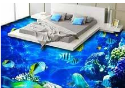
3D EPOXY FLOORING