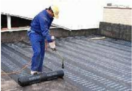
APP MEMBRANE WATERPROOFING