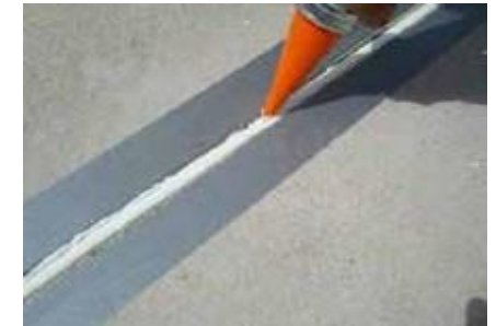
EXPANSION JOINT TREATMENT