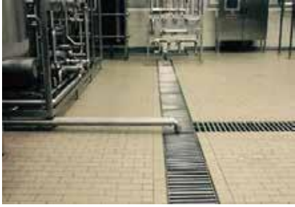
ACID PROOF TILE LINING